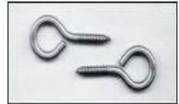
6 - Screw Eyes