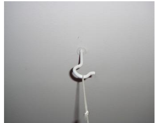
Screw Hook into Drywall Anchors - Attach loop of string