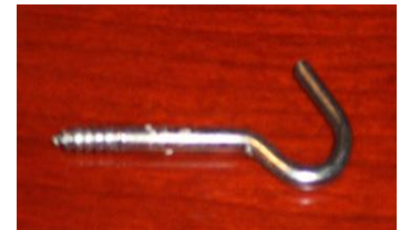
6 - Screw Hooks