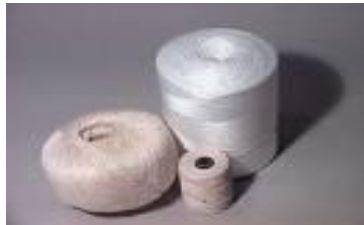
Approx. 15 feet of string