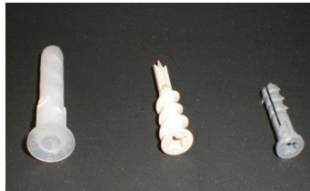
6 - Drywall Anchors

3 - Hardwood Dowels - 1 inch to 1-1/4 inch diameter by 8 feet in length. Length depends on the size of your canopy.